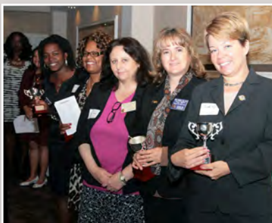
Outgoing Area Governors from Division C