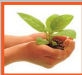
Help grow a new club!