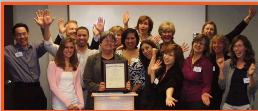
New club “True Blue” cheers for its mentors.

2. Being a New Club Mentor or Sponsor fulfills one requirement for the AL Silver award, leading to a DTM.